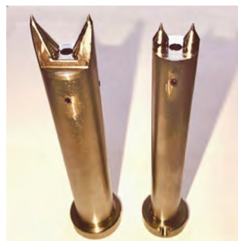
Be Copper with Plating